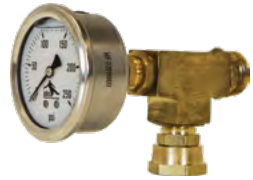
PSI Pressure Gauge TA-PG