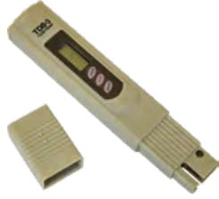
TDS Meter HMTDS-3