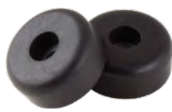
Replacement Feet WF7000-RF

Replacement Hoses available upon request. 1-800-989-4003