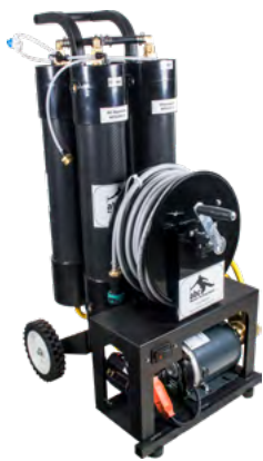
NXT 5 Upgrade TSNXT-U-5