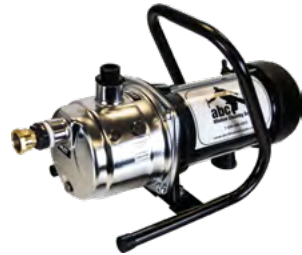
Booster Pump WF1000-BP