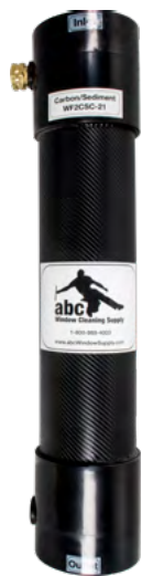
Carbon Filter WF2CSC-21