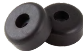
Replacement Feet WF7000-RF