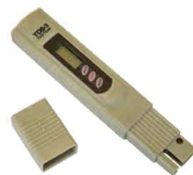
TDS Meter HMTDS-3

Replacement Hoses available upon request. 1-800-989-4003