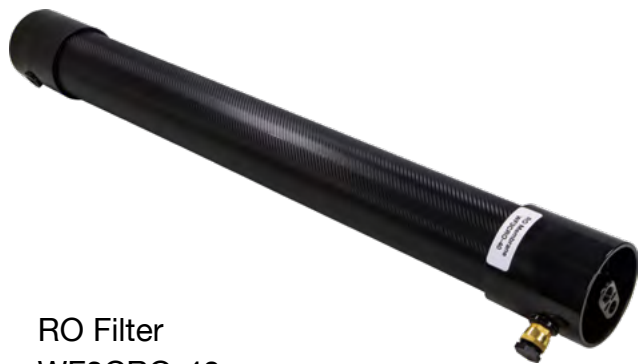
RO Filter WF3CRO-40