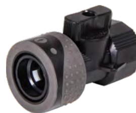
Shut-off Valve WF601311